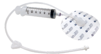
NPWT Cleanse Therapy Kit CLEANSE-KIT-A-18