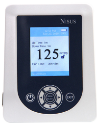
Nisus NPWT Pump CMPP-100