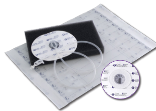
NPWT Wound Dressing Kit WDK-250 (SMALL) WDK-300 (MEDIUM) WDK-400 (LARGE)