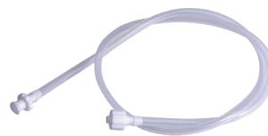
24" Extension Tubing CSP-100-ES-EXT