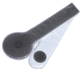
Bridge Foam NIS-BRDG-A-16