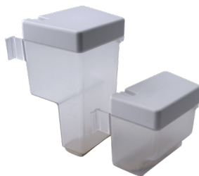
Nisus NPWT Canisters CPC-250 (250ML) CPC-500 (500ML)